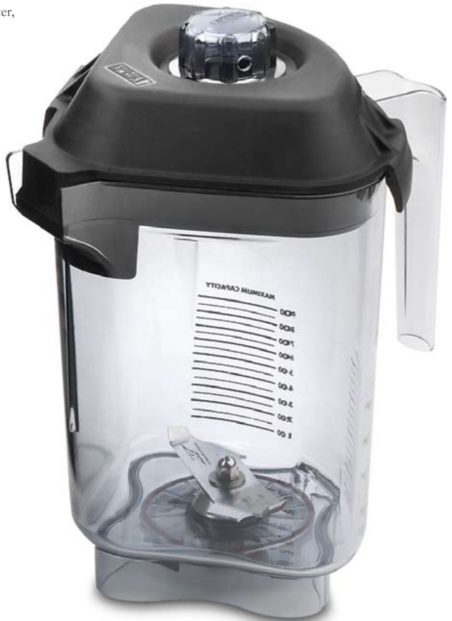
Faster, smoother pouring